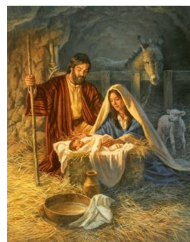
Mary and Joseph