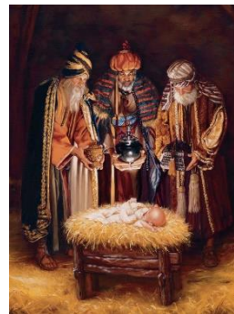
The Three Wise Men