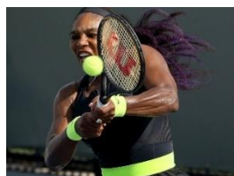
Serena Williams has won 23 Grand Slam titles. She is ranked as one of the World's greatest.