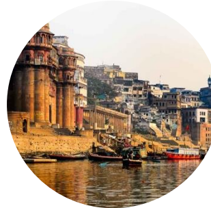
The River Ganges The River Ganges is sacred to Hindus.

Some rivers or pools are considered special or scared to followers of religion.