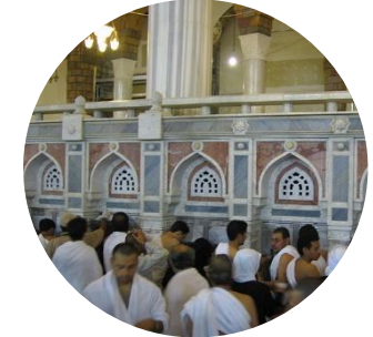
The Well of Zamzam The Well of Zamzam is sacred to Muslims.