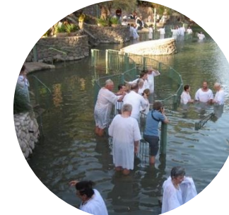
The River Jordan The River Jordan and the pools of Lourdes are sacred to Christians.