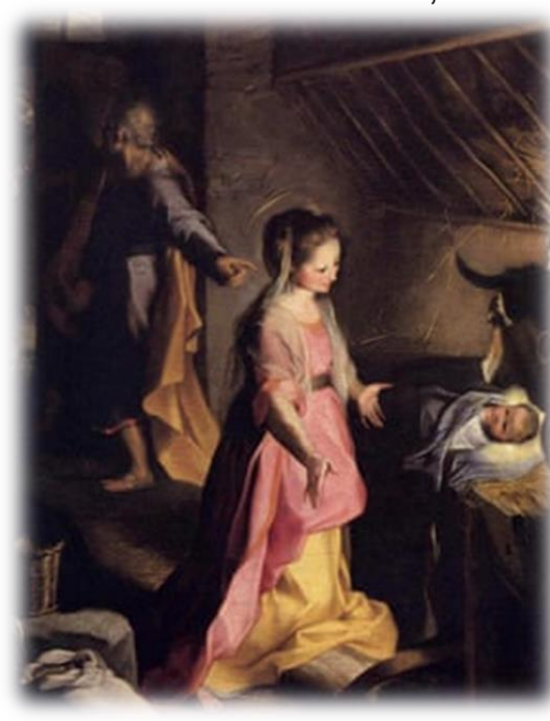
The Nativity Federico Barrocci, 1597

Technique – The way in which an artist creates their own.