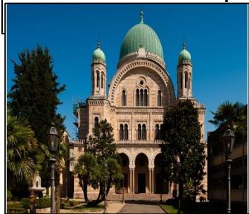
Image of the Great Synagogue of Florence, in Italy, Europe.

The main holy book of Judaism is the Torah , written in Hebrew . Synagogues are Jewish worship buildings.