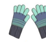
gloves des gants