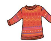
jumper un pull