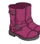
boots des bottes