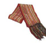
scarf une écharpe